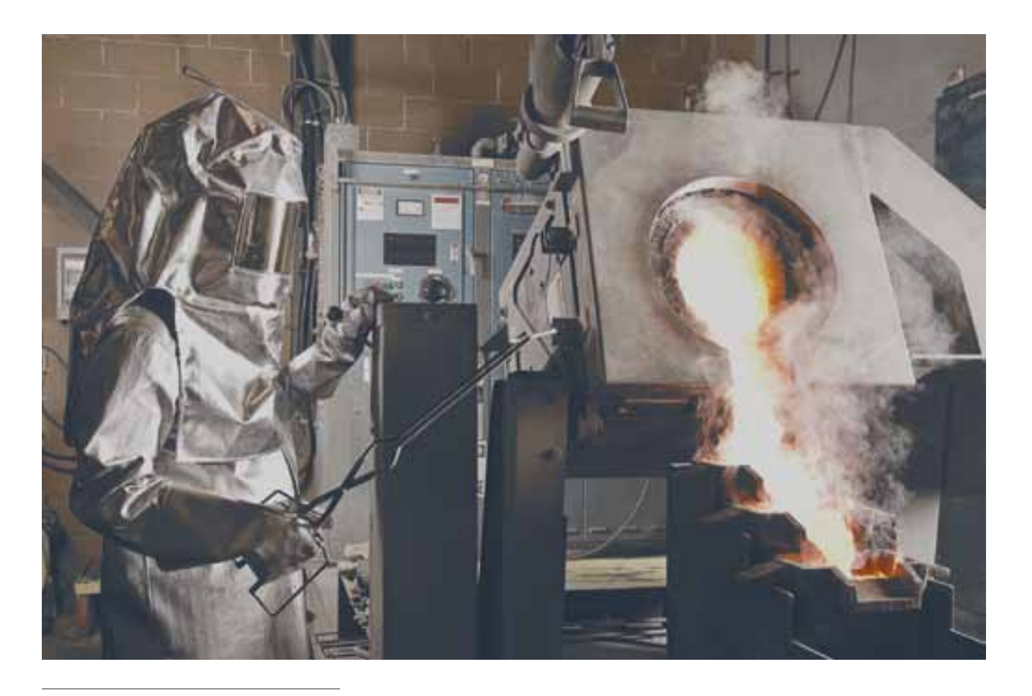
BLACK FOX MINE Gold pour in progress